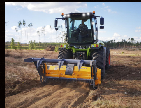
MJHS reclaiming soil after logging