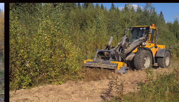
MC5-Hydraulic mounted to compact loader