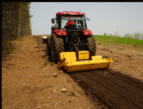
MJ clearing forest after logging

VERSATILE MERICRUSHERS FOR: LAND CLEARING >>> SOIL RECLAMATION >>> FARM LAND CLEARING >>> FORESTRY CLEARING >>> STUMP CRUSHING >>> PLANTING FURROW TILLING >>> PROPERTY CLEARING >>> ICE REMOVAL