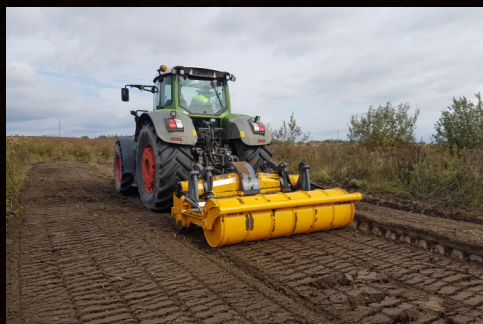
MJHS reclaiming soil for farming