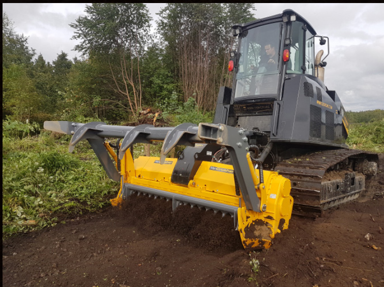
MT-700 with steel tracks and MJHS-2.4 meter crusher clearing dense vegetation. Crusher is equipped with heavy-duty push bar and sizing screen.

Equipped with mechanical power take-off is the most efficient crawler tractor in the market. The MT 700 can operate under conditions where conventional tractors lose power and traction. Thanks to adequate engine power, and a mechanical power take-off, the MT 700 enables quicker, more efficient operations at a lower cost per hectare.