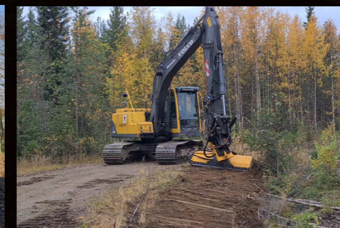
MC4-Hydraulic mounted to excavator