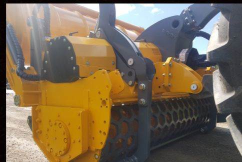
MERICRUSHER MJHS + MJFS models can be equipped with patented ROTA screen