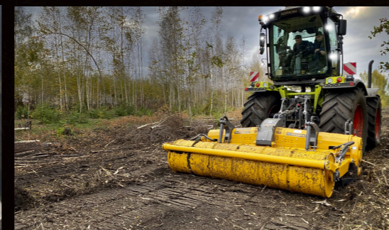
MJHS in land clearing