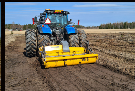
MJS clearing new farmland after logging