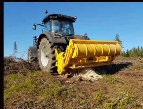
MJS crushing stumps after logging