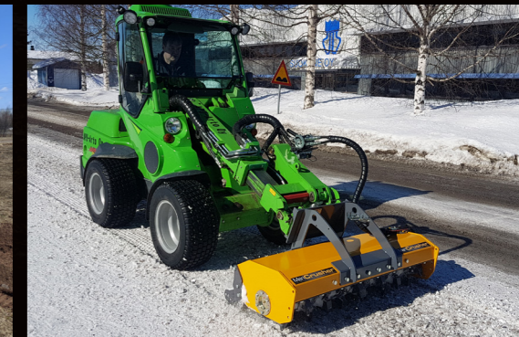
MC4-Hydraulic crushing ice and hardpacked snow