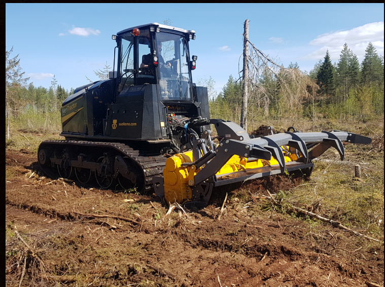
MT-700 with rubber tracks and MJHS 3.1 meter crusher reclaiming soil after harvesting before replanting