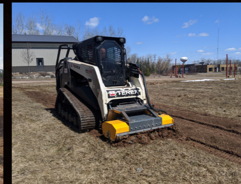
MC4-Hydraulic reclaiming soil