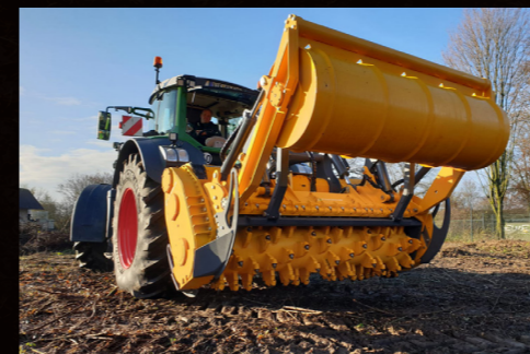
MJFS clearing the construction site